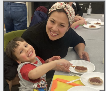
At the WIC Fit Families parent night in March, parents learned about "The Family Kitchen" and prepared healthy recipes with their kids.

NUTRITION: Waukesha County FoodWise educators engaged with three parent groups in series of nine Eating Smart and Being Active (ESBA) lessons at Life's Connection clinics in Waukesha and Mukwonago. Parents and children participated in the food tasting portion of lessons together, trying healthy recipes like butternut squash mac, apple salad, tuna melts, zesty bean dip, and veggie quesadillas. Parents were excited to have new ideas for using familiar foods and food pantry items. Pre/post surveys showed 100% of participants improved diet quality and physical activity. One parent reported making veggie quesadillas multiple times for her kids, eating more fruit, and being more active, which improved her back pain. Another reported that she now uses some of the money-saving ideas discussed when shopping. Overall, evaluations have shown ESBA provides practical skills and health benefits for families.