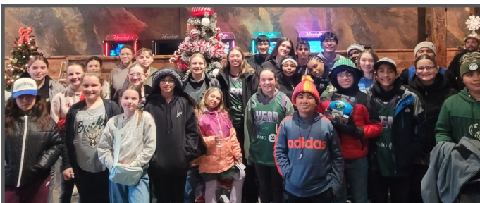
Positive Youth Development / 4-H Youth from Waukesha, Milwaukee, Racine and Kenosha County attended the Wisconsin Herd Basketball game in Oshkosh.

A special thank you to our 2025 sponsors of Extension Waukesha County 4-H Kids Zone and 4-H Summer Camp: Blain's Farm & Fleet, Woodman's Markets, Kwik Trip, Keena & Associates, Novonesis, Waukesha State Bank, Eaton, Summit Credit Union, Core Creative, and MWR Painting LLC.