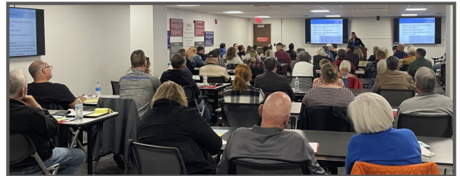
The Plan Commission Fundamentals Workshop engaged 88 local officials.

Landscape and Grounds Maintenance Short Course Participant