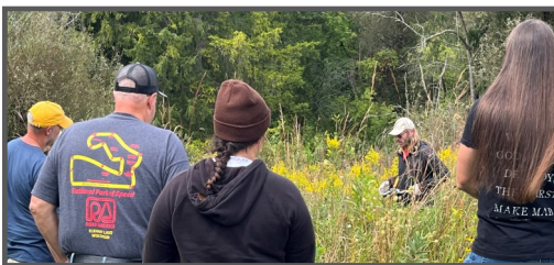
Over 200 green industry professionals learned about invasive species plant identification and management at the Urban Forestry Workshop.

"My son enjoyed one of his classes so much that he has considered pursuing an education pathway related to food science and nutrition... in our house, both [my kids] show an interest in reading food packaging labels, food preparation, and cooking—I'm happy to encourage them both and am thankful for your class."